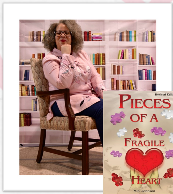
AVAILABLE ON AMAZON!